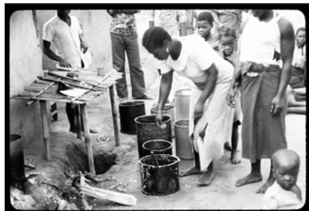
Cooking out in the open. Eight buckets for a large group.