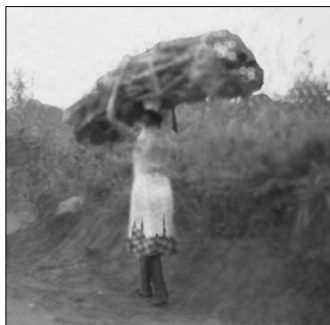
This lady laughed when I could not lift

At that church service, I experienced a holy moment . It was the most elaborate service I have ever witnessed. I shall never forget that day. Here it is some twenty years later and my memory is as fresh as if it were yesterday. I can still hear the leaves rustle overhead. When we got to the appointed place, we were invited into the place of worship . . . there were pews bamboo logs laid across the building were the trees that surrounded us, and the roof was the branches and leaves that extended over our heads. That ceiling was colored a beautiful green and blue. The atmosphere, the hospitality, and the love that surrounded us, made this a moment to remember; truly, a holy moment . I could feel the presence of God in that service. It was not cold, but I caught myself shivering.