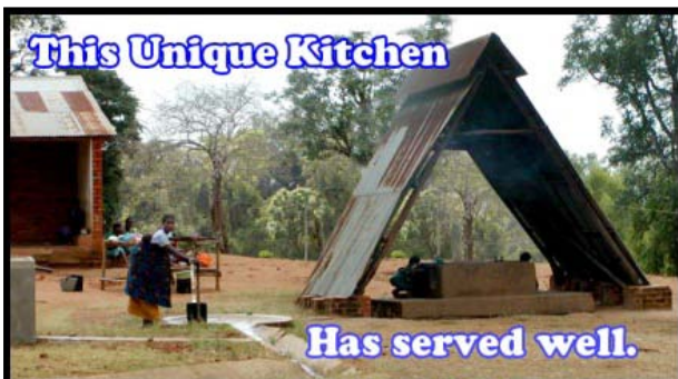
This Unique Kitchen