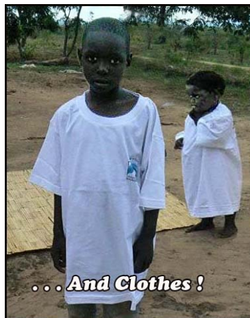
... And Clothes !