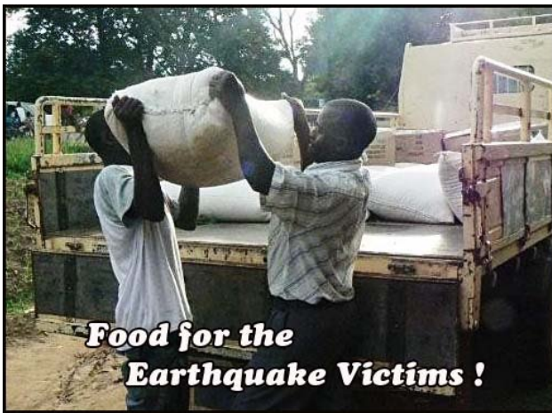
Food for the Earthquake Victims !

Food and clothes are sent by the Mission to earthquake victims in northern Malawi. Rebuilding will take a long time, but it will get done. Your donations help.