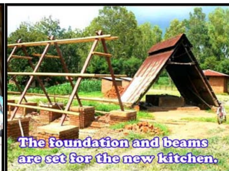
The foundation and beams are set for the new kitchen.