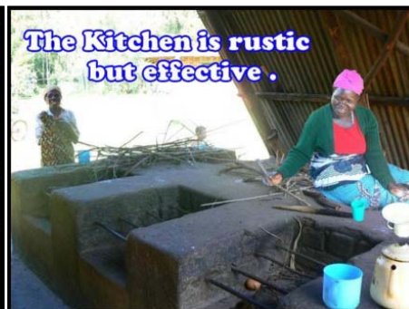
The Kitchen is rustic but effective .